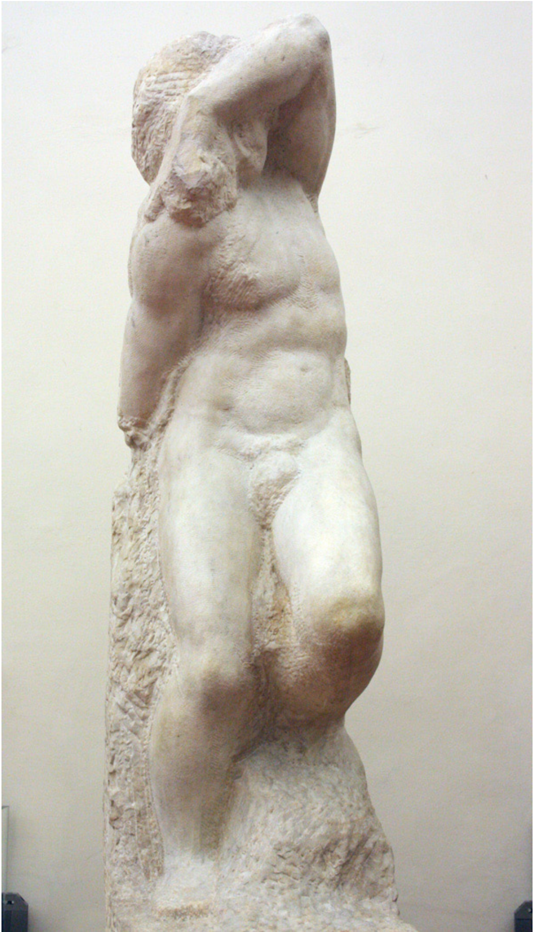
Michelangelo The Young Slave, ca 1520/23