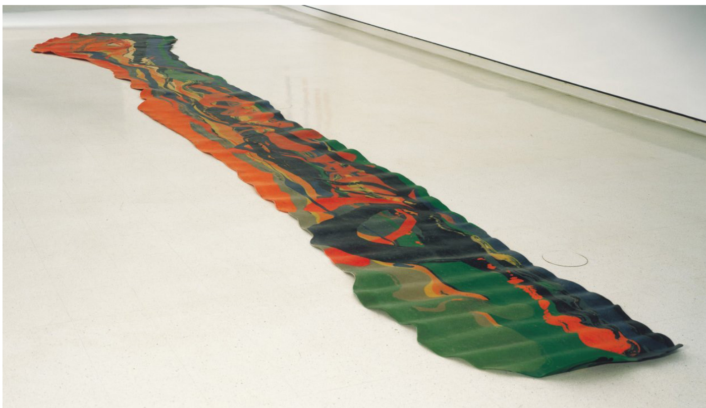
Lynda Benglis Fallen Painting, 1968 pigmented latex rubber overall (irregular): 901,7 x 175,9 cm