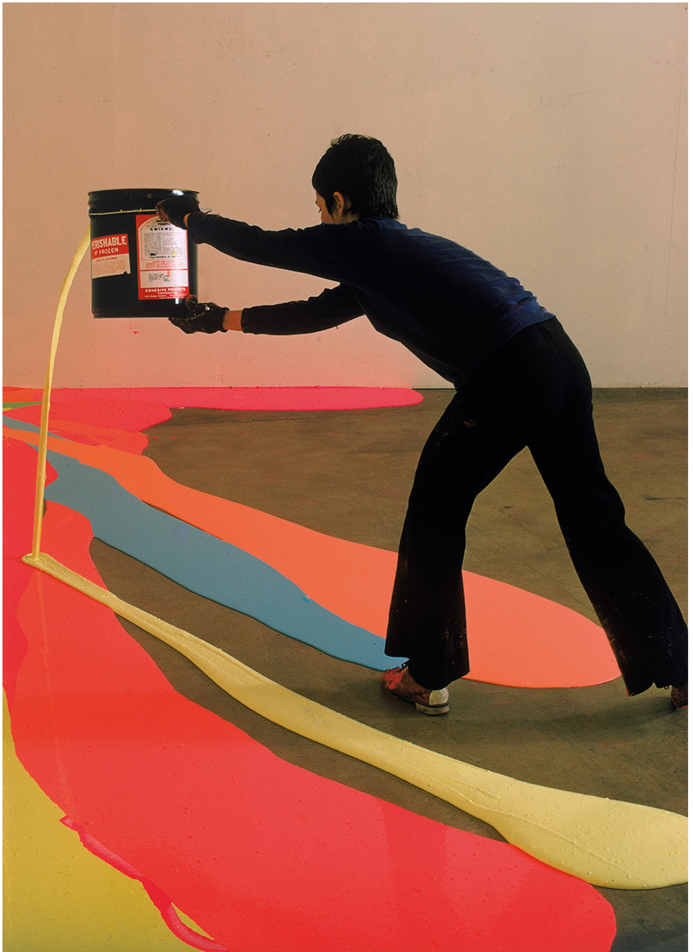
Lynda Benglis painting the floor with 40 gallons of pigmented latex, University of Rhode Island, 1969.