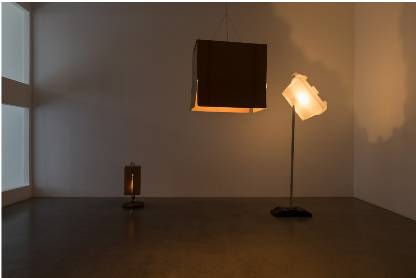
Installation view, Klara Lidén, Berlin Fall, Galerie Neu, Berlin, 2019