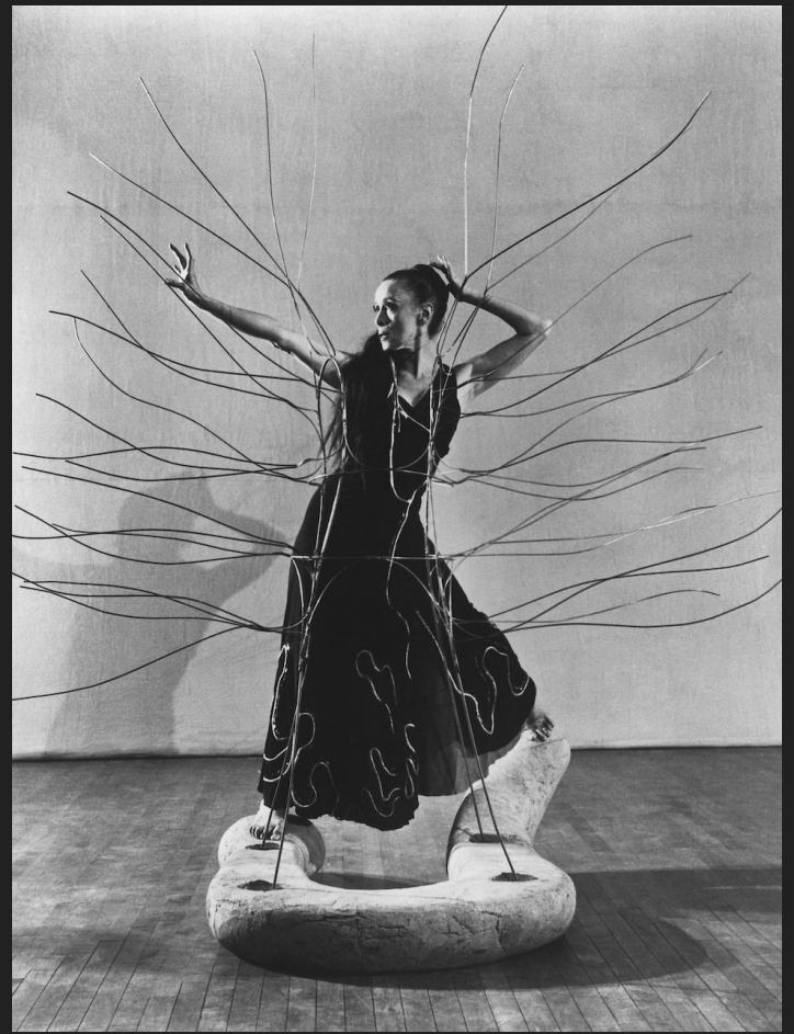
Cave of the Heart, 1946